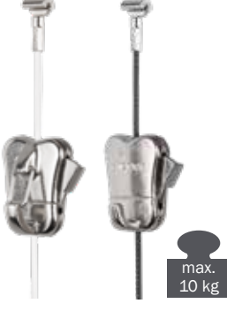
steel cable white or black + zipper or zipper pro